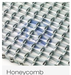
Our conveyors can be fitted with many other belting options such as plastic modular, balanced weave