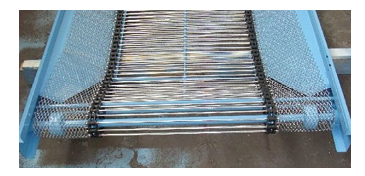
Chain edge rodded central mesh and loose flexible chain link mesh edges.