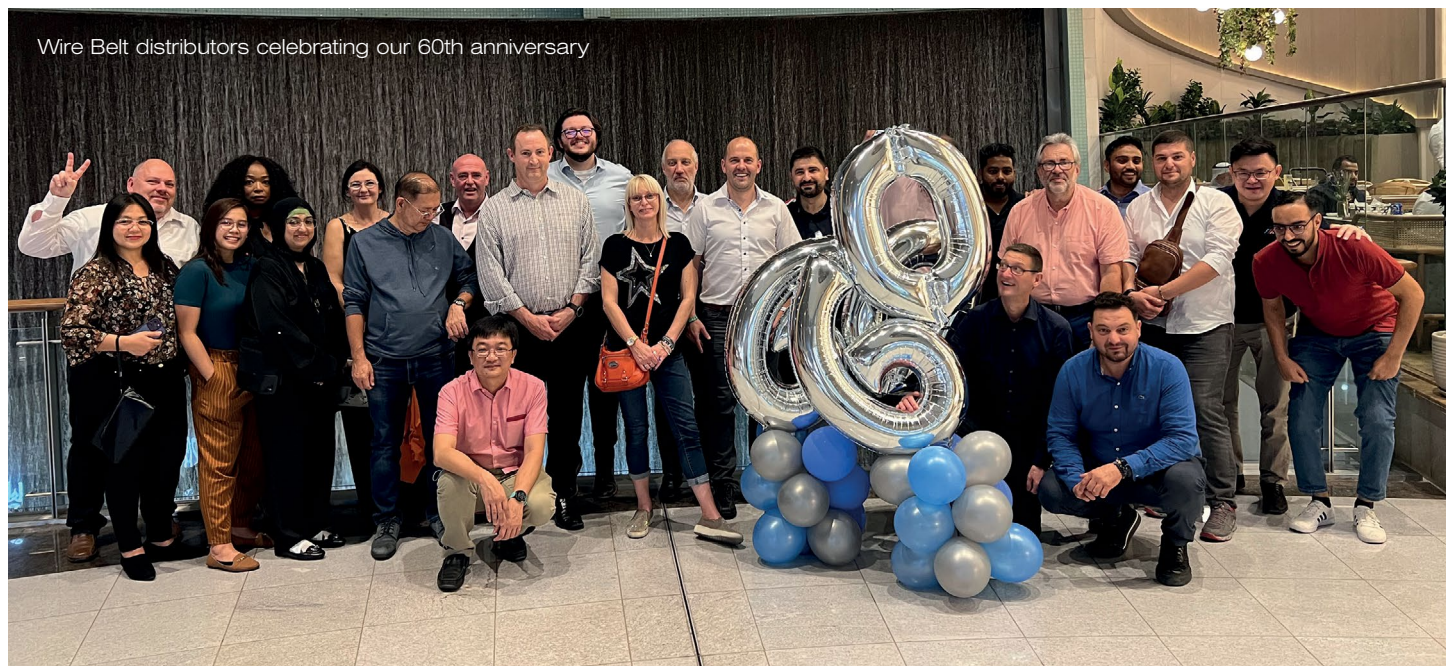
Wire Belt distributors celebrating our 60th anniversary

Thanks to this, Wire Belt Company Ltd continue to look forwards to the next sixty years, working alongside our group companies in America and Germany to pursue our vision to be the 'most preferred, respected and trusted conveyor belt manufacturer in the world'.