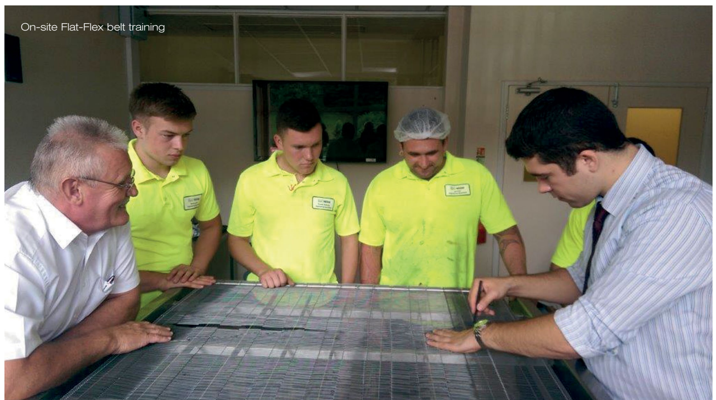
On-site Flat-Flex belt training

The Wire Belt team is always on hand to help with any problems you may encounter, if you can't find the solution through our Help Centre on our website, feel free to contact us at sales@wirebelt.co.uk and a member of our team will be happy to assist you!