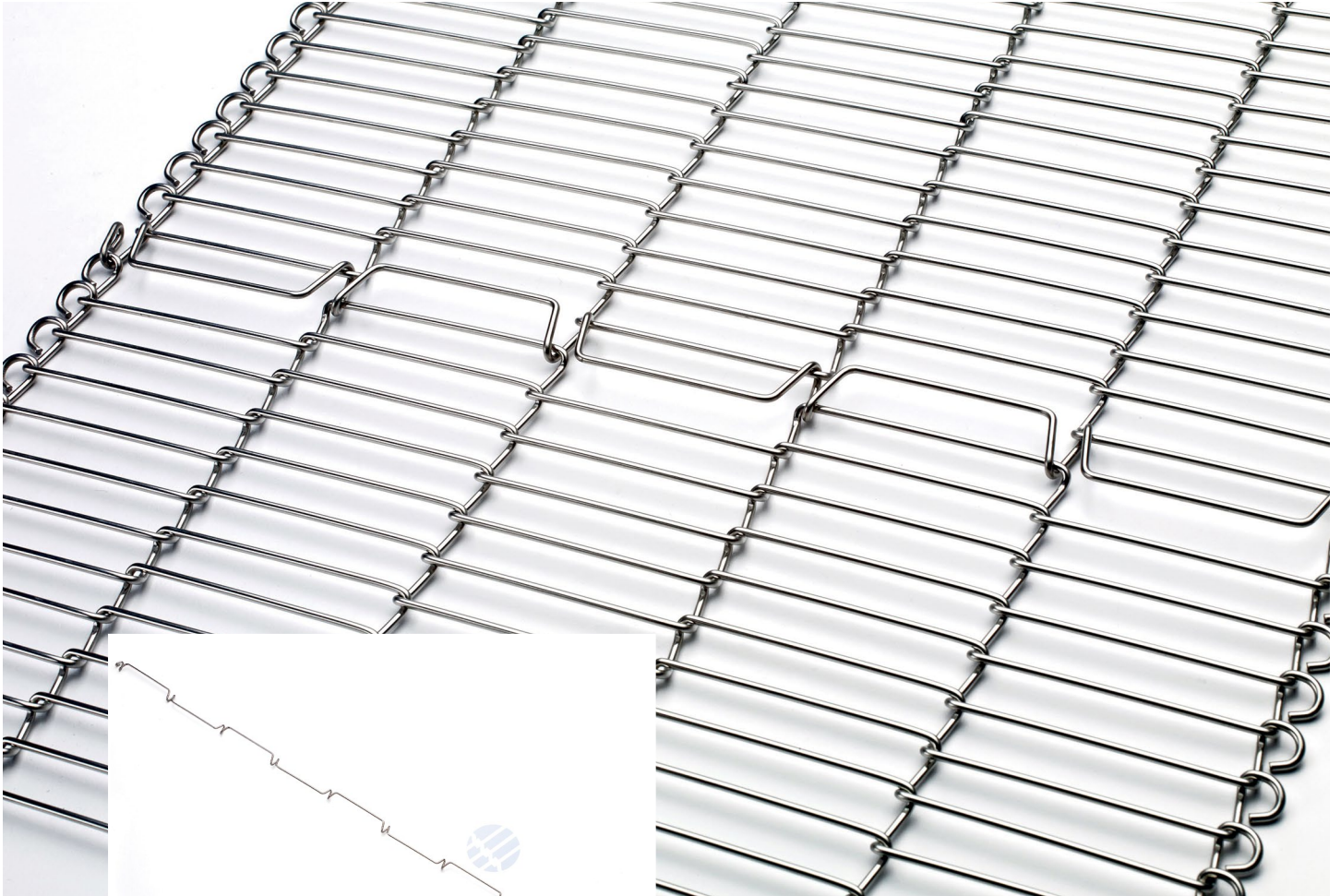
Flat-Flex fitted with EZSplice